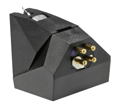
Rear pins are colour coded and an earth plate connects the screen to Right channel (green) ground.

The body has integral threads for the fixing screws, making attachment easy. There's a knack to getting the